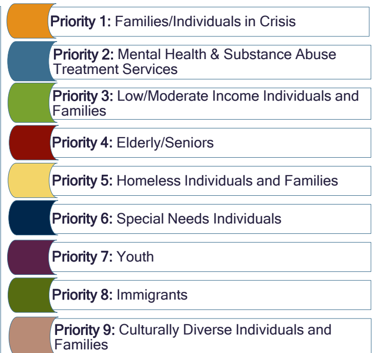
Figure 2. Gilbert's Nine Priority Populations